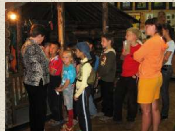
Изучаем быт коренного населения п. Хужир