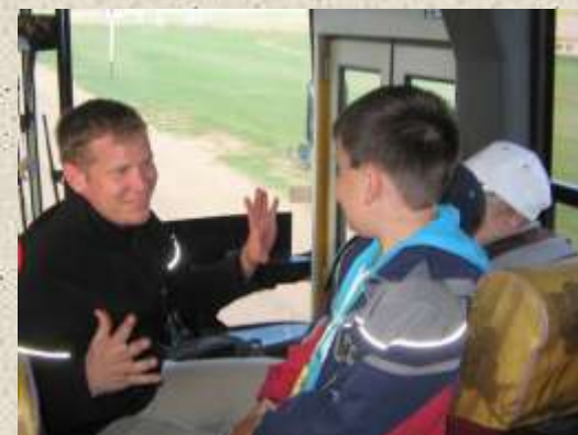
Практикуем английский уже в автобусе