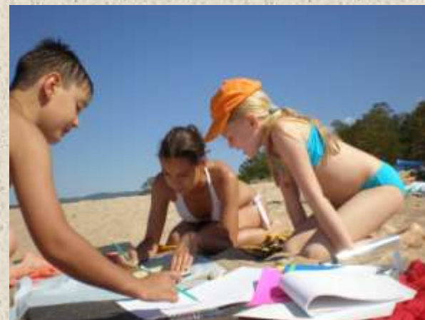
Создаем флаг команды