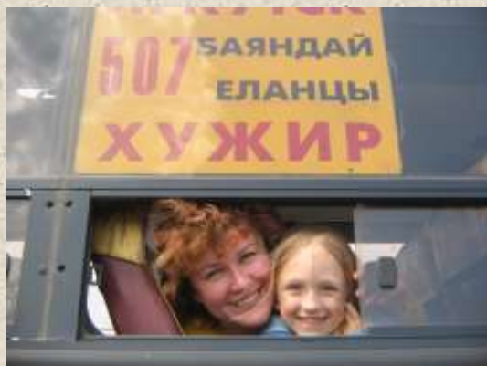
Скорее на отдых!