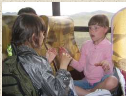
Знакомство друг с другом