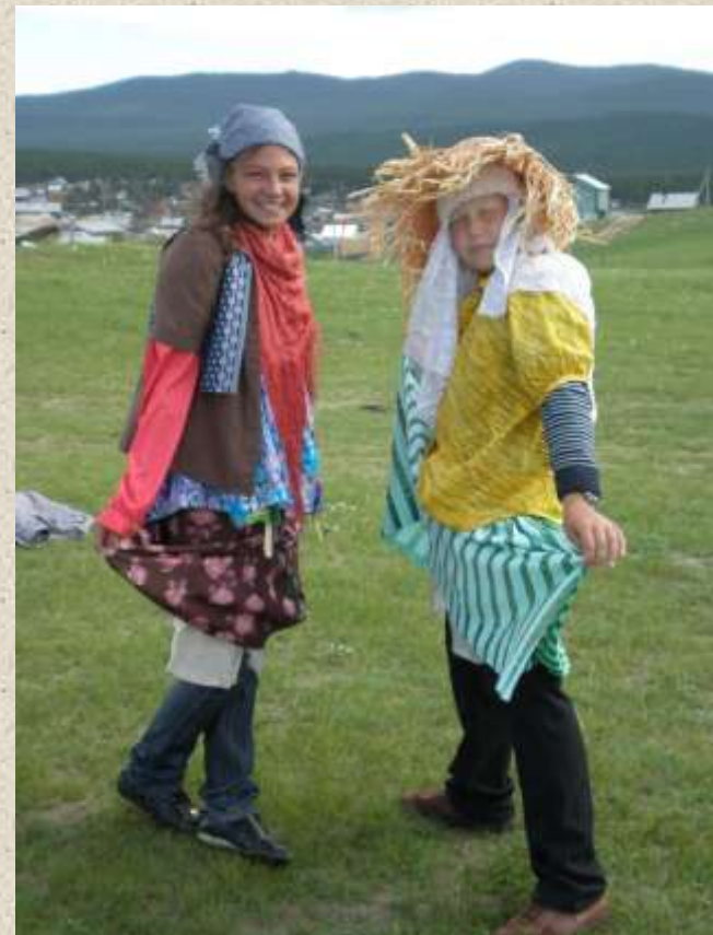
Вожди племен в национальной одежде