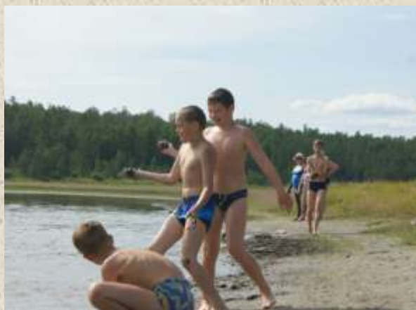
Серо-водородное озеро Шара-Нур