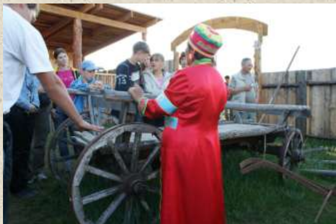
Посещение бурятской деревни