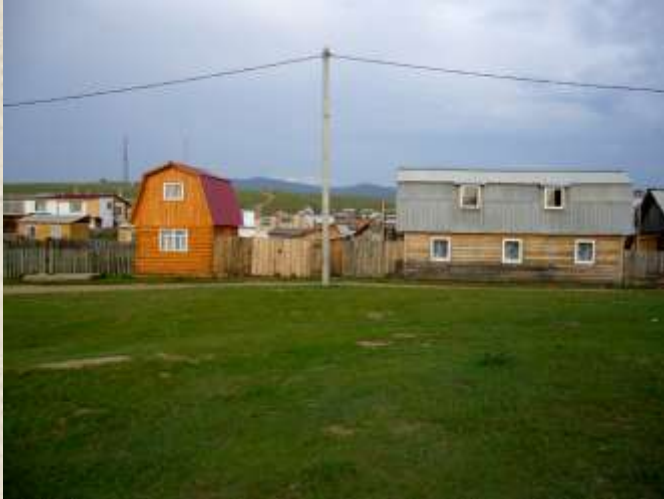
Наш жилой комплекс