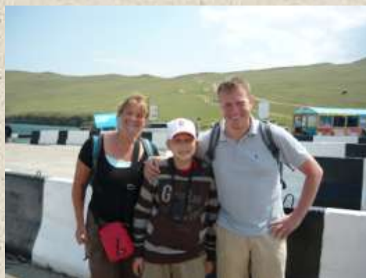
Новые знакомые из Голландии