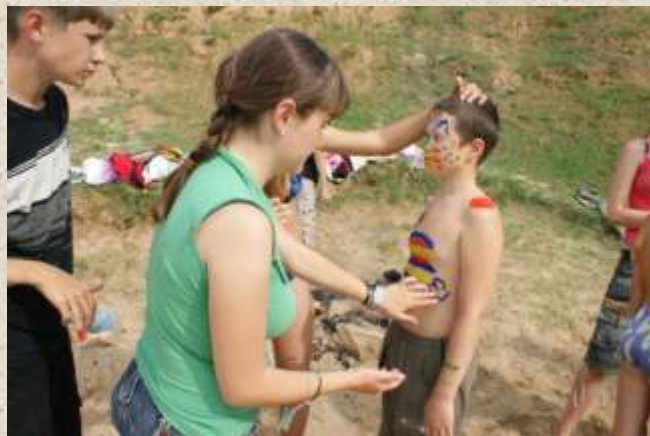
Неотъемлемый атрибут посвящения